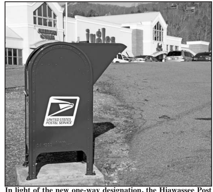
In light of the new one-way designation, the Hiawassee Post Office installed a drive-up mailbox last week for customers who don't want to get out of their cars.

parking lot are in the works, including slanted parking spots the works for several years,